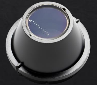
Cone hood scale contact plate