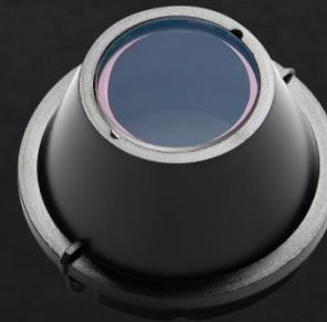
Cone hood contact plate (no scale)