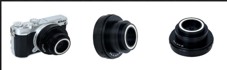
Mirrorless camera adapter for Canon, Sony, Nikon