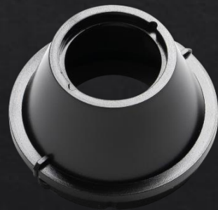
Cone hood (open top)