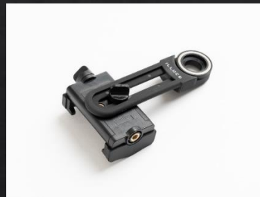
Universal smartphone adapter