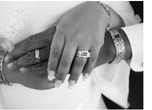
▼ Dark Skin Patient