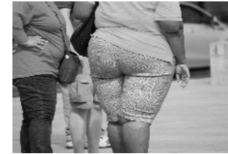
▲ Obese Person/Bloated Patient