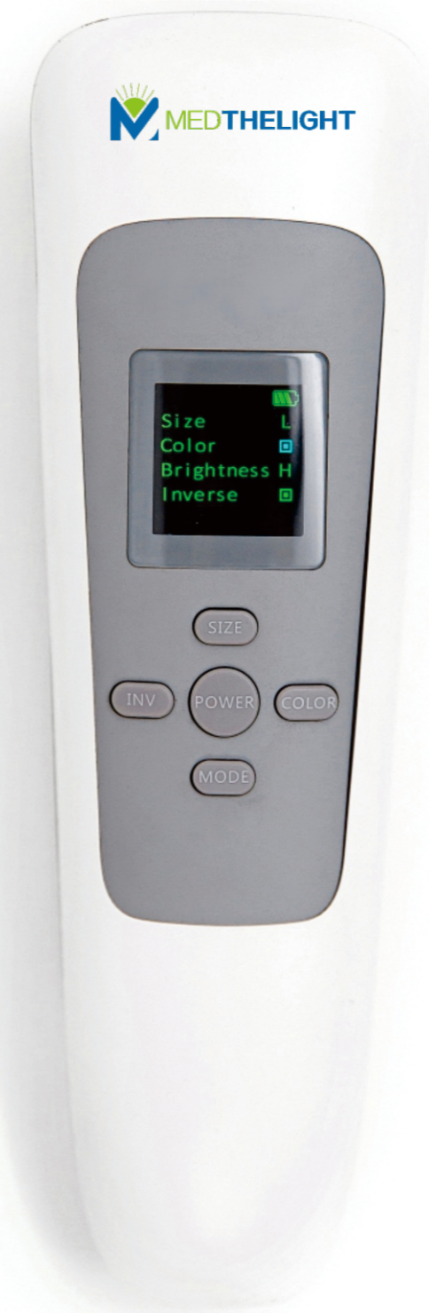
Aurora 100 Vein Finder

Shenzhen Medthelight Co., Ltd. Add: New World Yishan Garden (Phase III) D804, North of Wutong Road, Shatoujiao Street, Yantian District, Shenzhen, 518000, P.R. China. TEL: +86 755 2398 4135 E-Mail: medthelight@medthelight.com